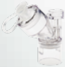
Aerogen® Solo AG-AS3200